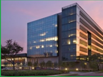
LEED Gold Headquarters Building Houston, Texas 1,000 Ton Cooling Tower